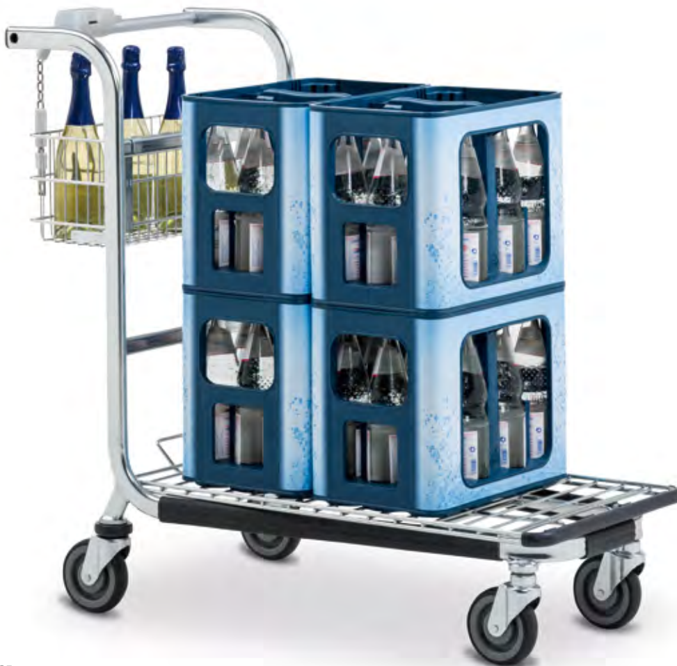
T25 Transport trolleys with Wanzl-Box Solid accessory