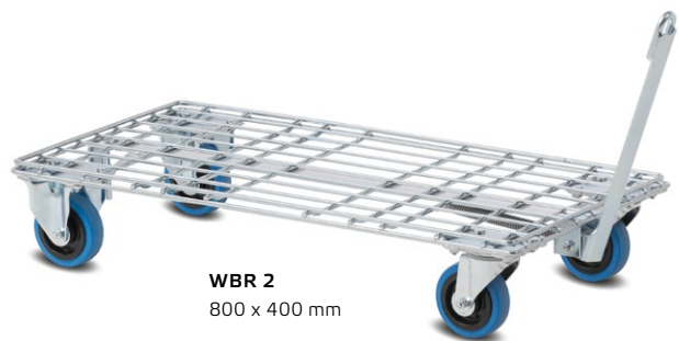
WBR 2 800 x 400 mm