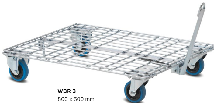
WBR 3 800 x 600 mm

Standard equipment: Support surface made of mesh grate. Coupling drawbar for coupling of multiple floor rollers.