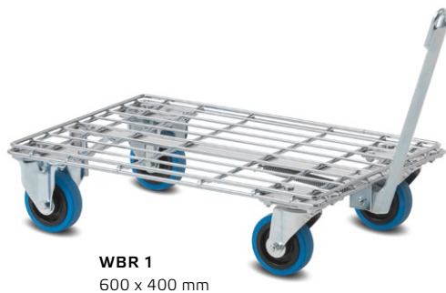
WBR 1 600 x 400 mm