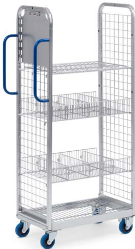
KT2 basic model with accessories

Standard equipment: chassis made of square tubing and a welded bottom tray. Side panels made of square tube frame with wire grate, inserted into chassis and riveted into place.