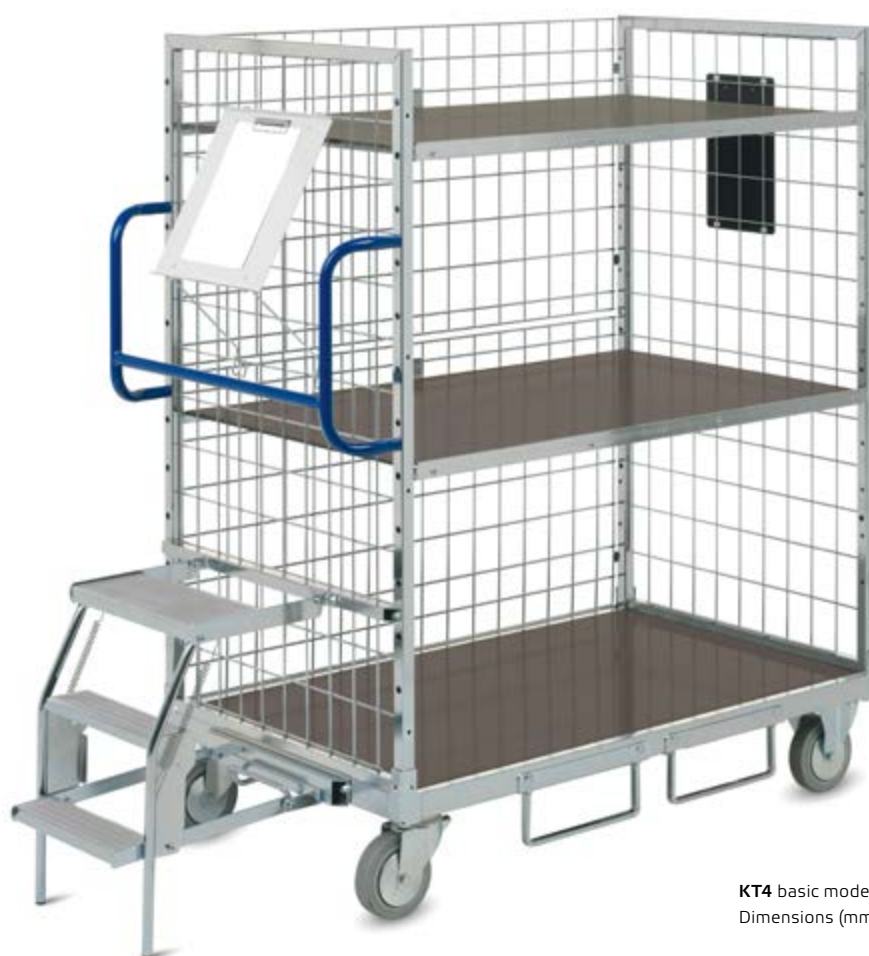
KT4 basic model with accessories Dimensions (mm): L 1,306 x W 806 x H 1,650

Standard equipment: chassis made of square tubing with non-slip wooden base. Side panels made from square tube frame with wire grate, inserted into chassis and screwed-in place. Wooden shelves can be screwed-in at height increments of 100 mm.