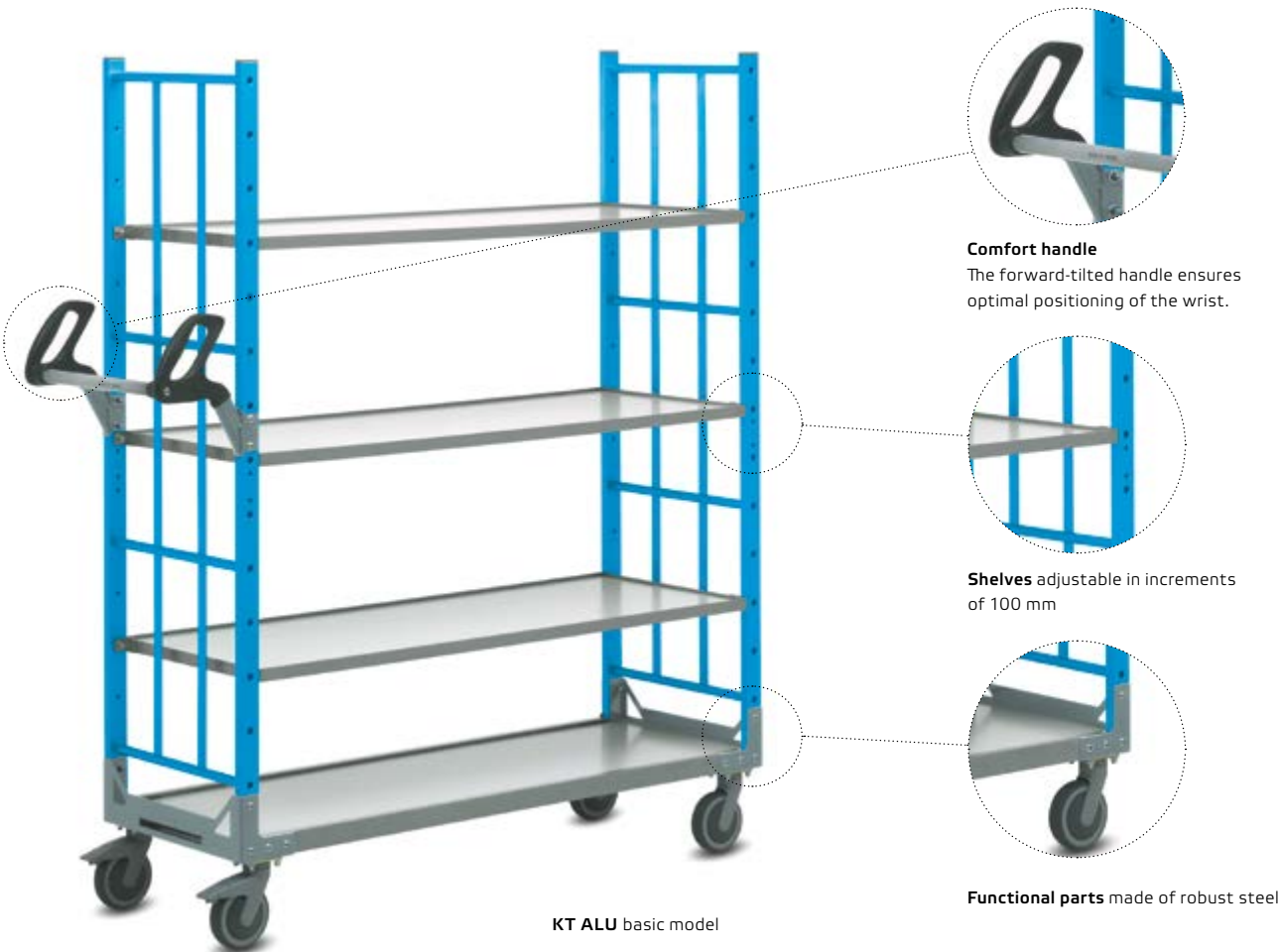
KT ALU basic model

Standard equipment: side panels, shelf frames and chassis frame made of aluminium. 3 shelves with platform made from aluminium-plastic composite material, can be bolted on at 100 mm intervals. Ergonomic comfort handle. Functional parts made of steel for optimum stability.