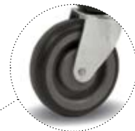
As standard: The quality swivel castor from Wanzl