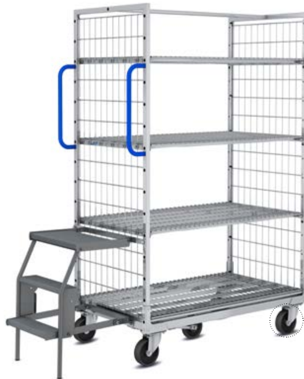
KT3-X Equipment example