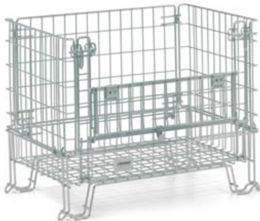
MC 300 PALLET CONTAINER