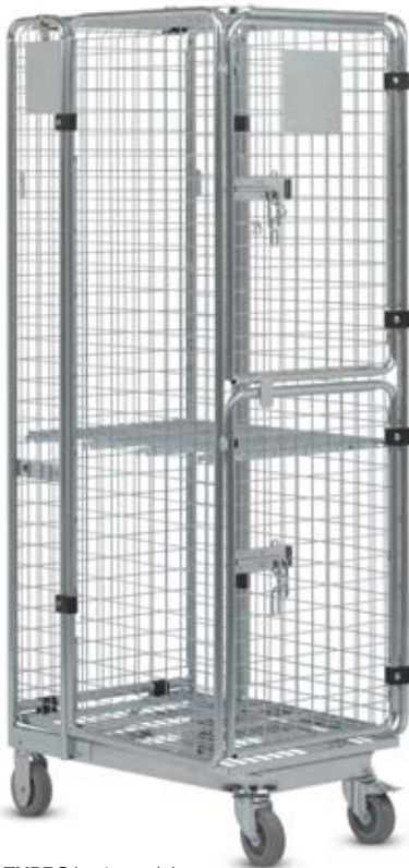
RC/N3 TYPE 2 basic model