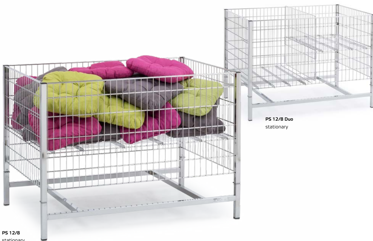
PS 12/8 stationary