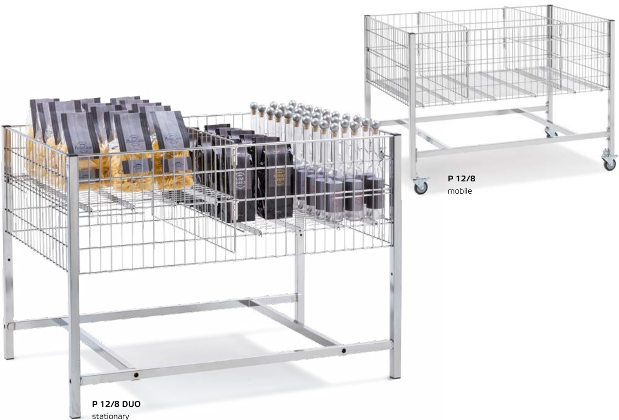
P 12/8 DUO stationary