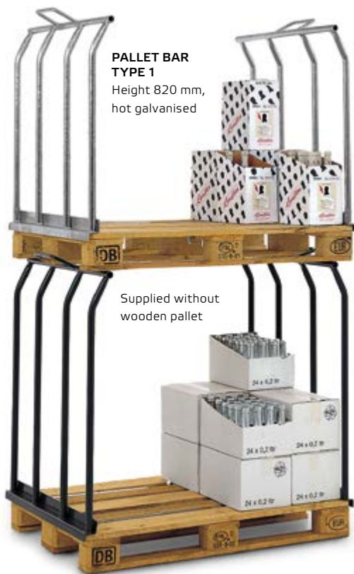
PALLET BAR TYPE 1 Height 820 mm, hot galvanised