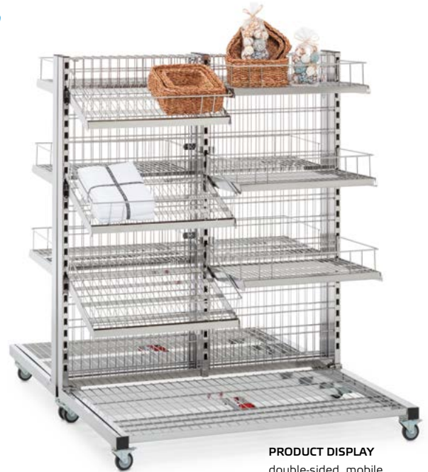
PRODUCT DISPLAY double-sided, mobile