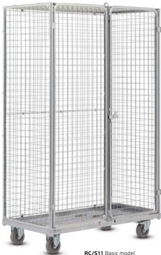
RC/S11 Basic model