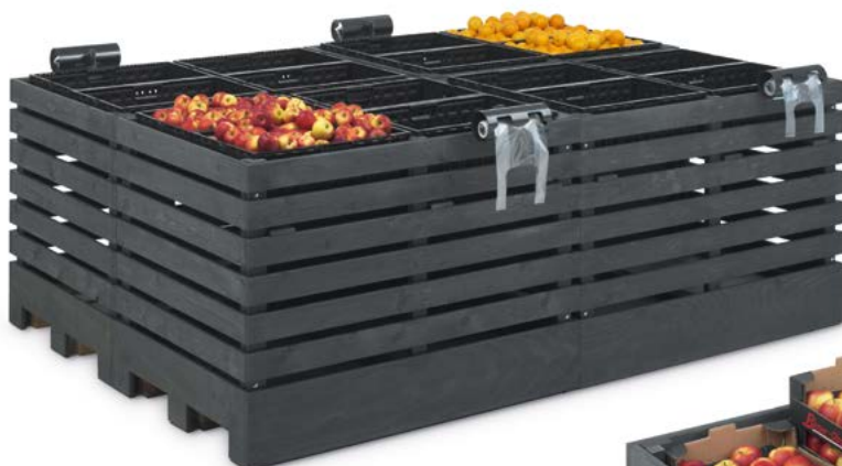
PALLET BOX 4x

> Lowlift transport also possible when loaded