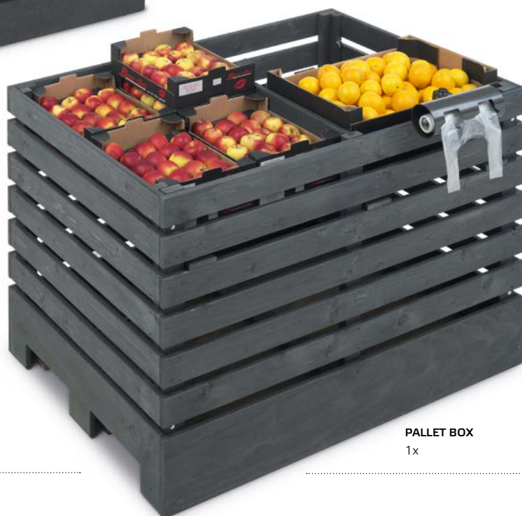
PALLET BOX 1x